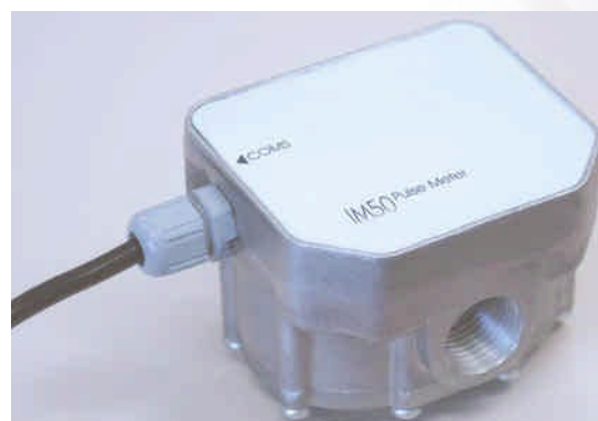
IM50 PULSE VERSION